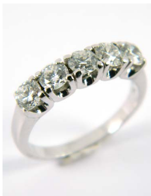
Lot 83 €1,000-€1,200