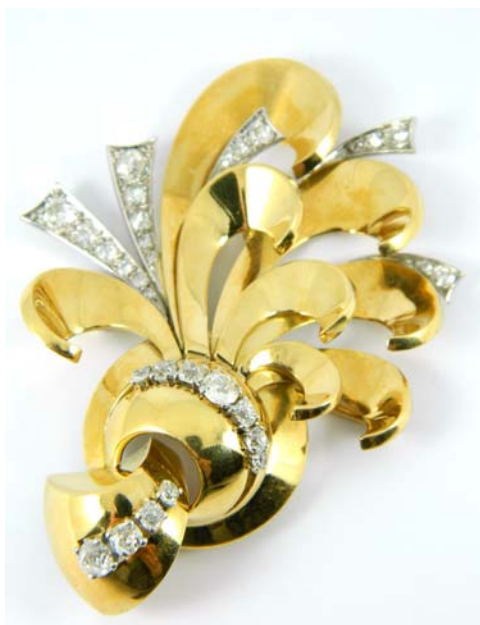
Lot 147 €1,500-€2,000