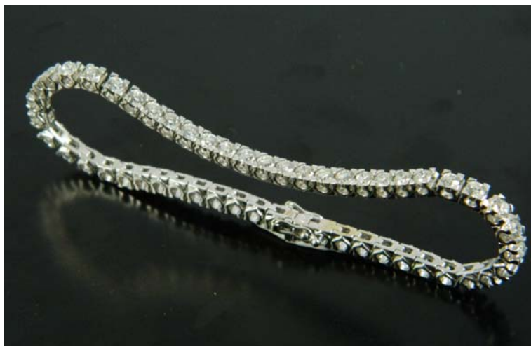
Lot 202 €3,500-€4,500