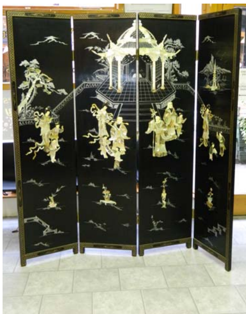
Lot 351 €100-€300