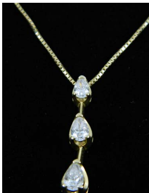
Lot 204 €700-€900