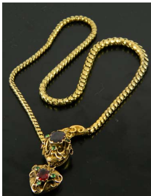
Lot 161 €800-€1,200