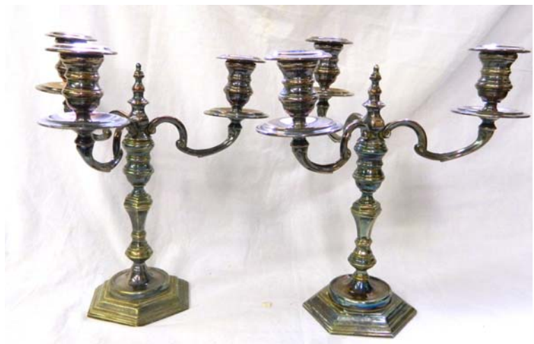
Lot 292 €1,000-€2,000