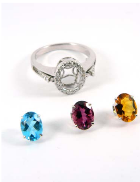
Lot 109 €400-€600