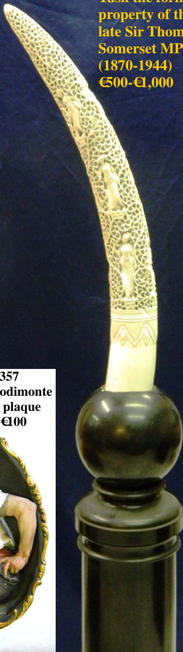
Lot 357 Capodimonte wall plaque €50-€100