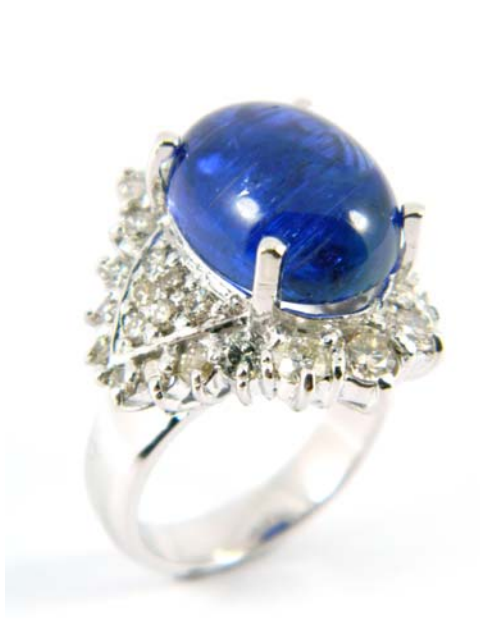
Lot 89 €1,500-€2,500