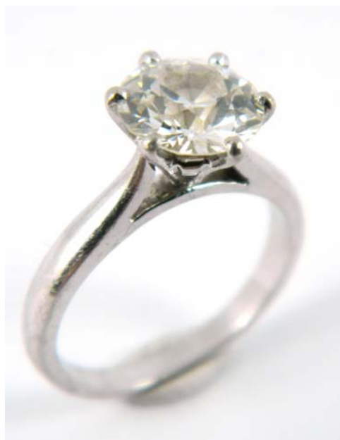
Lot 146 €3,000-€4,000