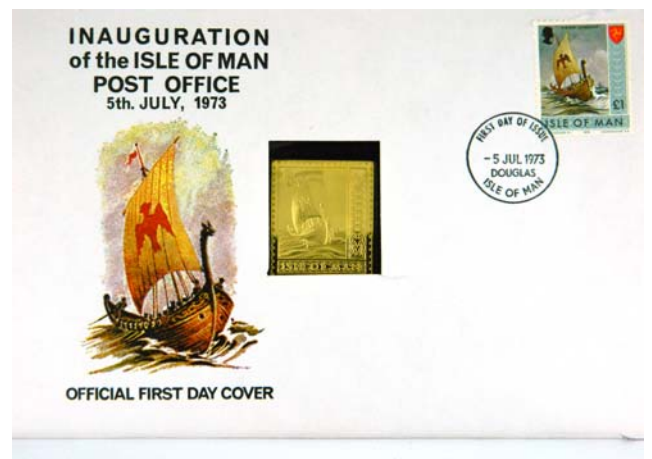
Lot 302 €600-€900