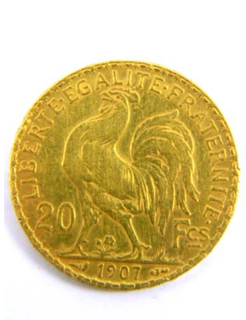
Lot 334 €150-€200