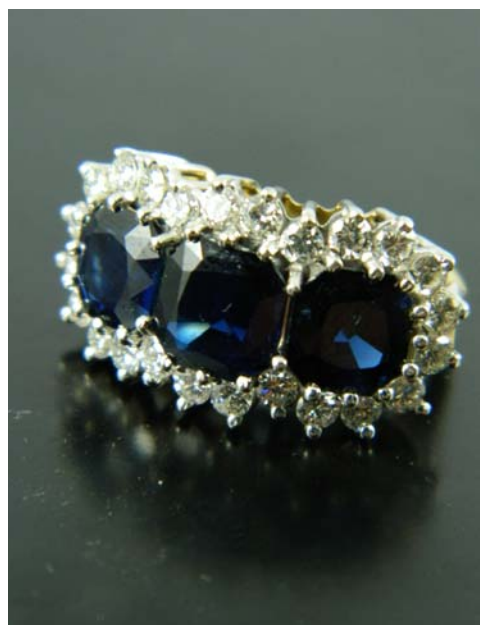
Lot 221 €1,500-€2,500