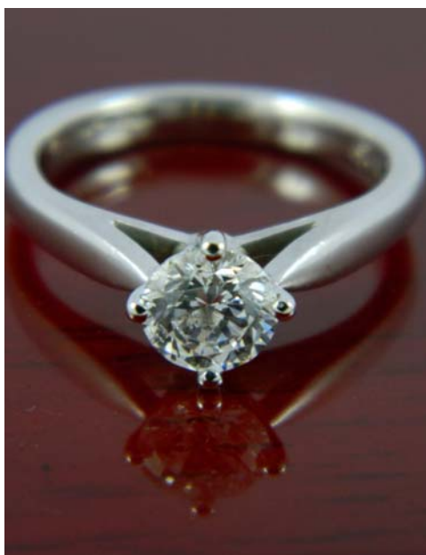
Lot 151 €2,000-€3,000