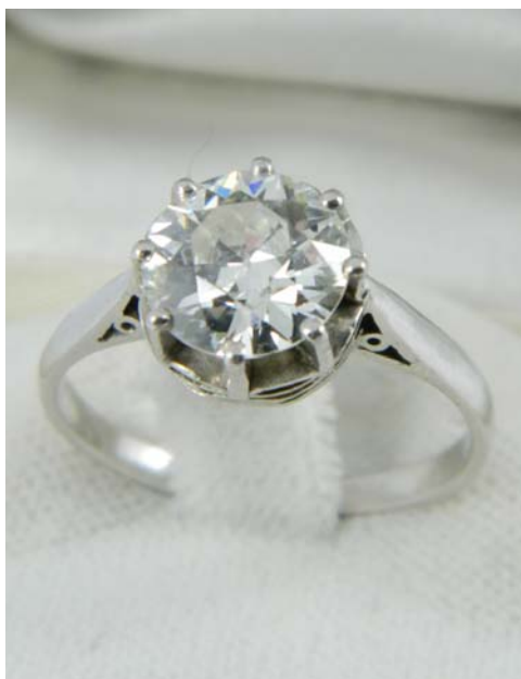
Lot 145 €4,000-€6,000