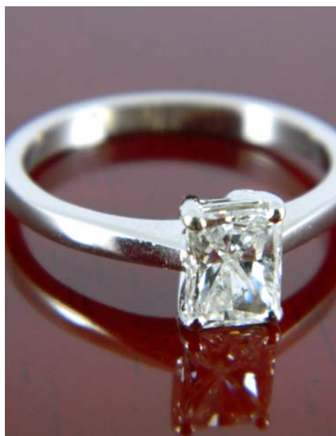
Lot 188 €2,500-€3,000