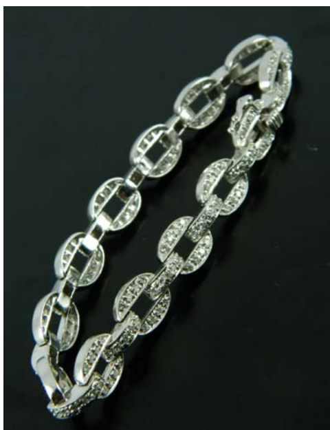
Lot 158 €3,800-€4,200