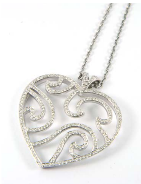
Lot 108 €500-€700