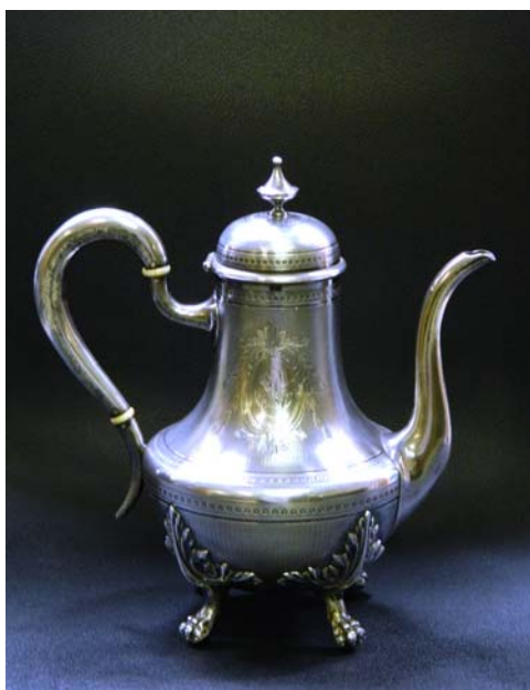
Lot 291 €100-€200