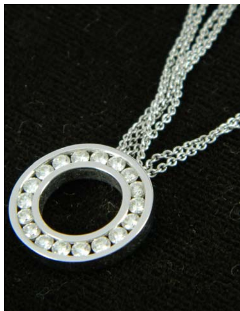
Lot 190 €600-€900