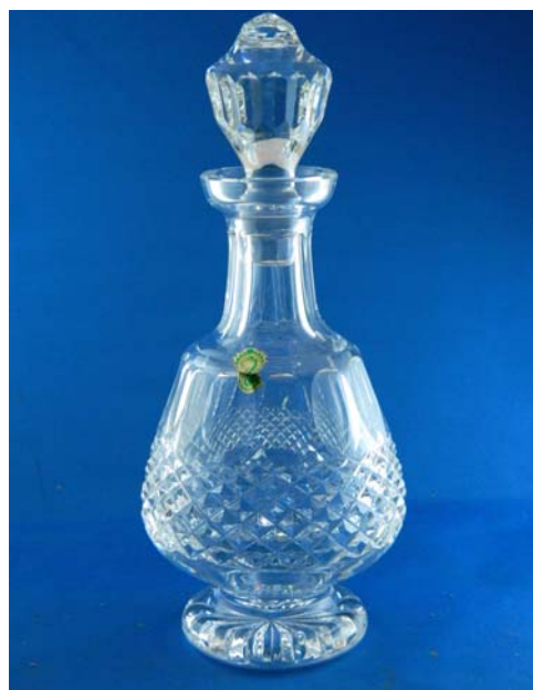
Lot 312 €60-€90