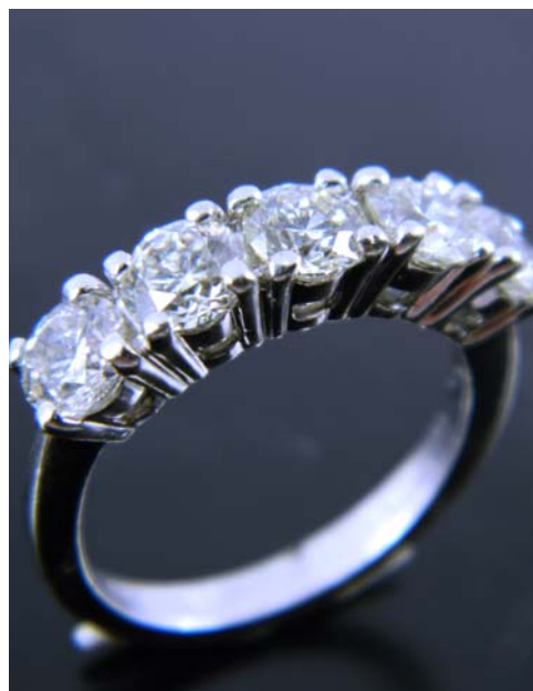
Lot 157 €4,500-€5,000