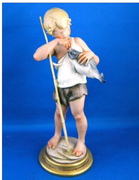
Lot 361 €30-€50