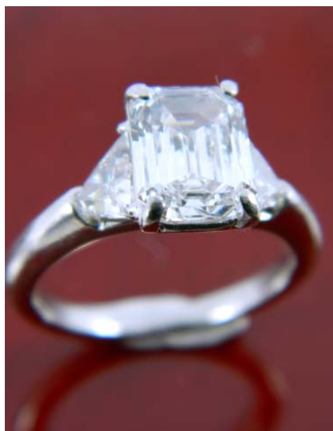
Lot 150 €6,000-€8,000