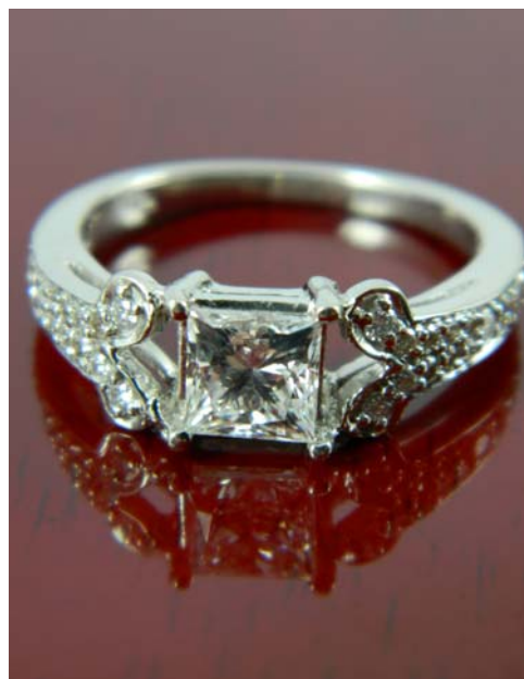
Lot 199 €3,500-€4,500