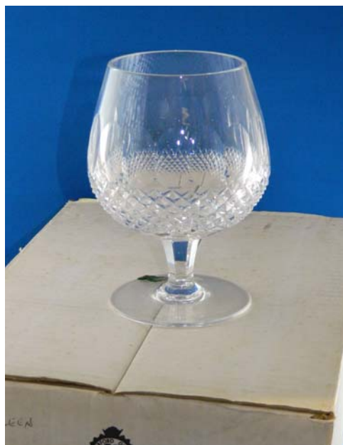
Lot 321 €60-€100