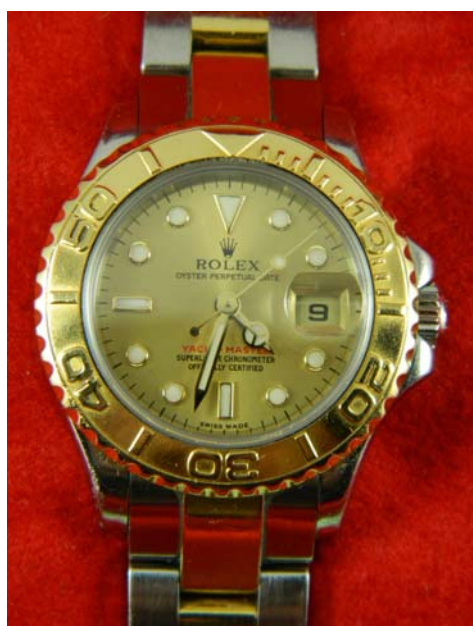
Lot 242 €2,500-€3,000