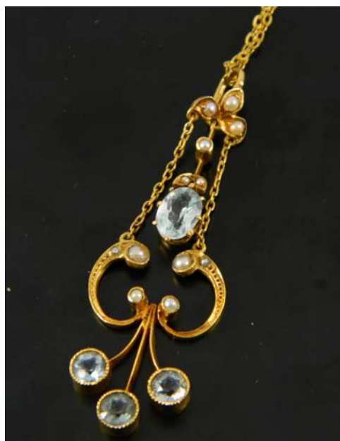
Lot 216 €150-€250