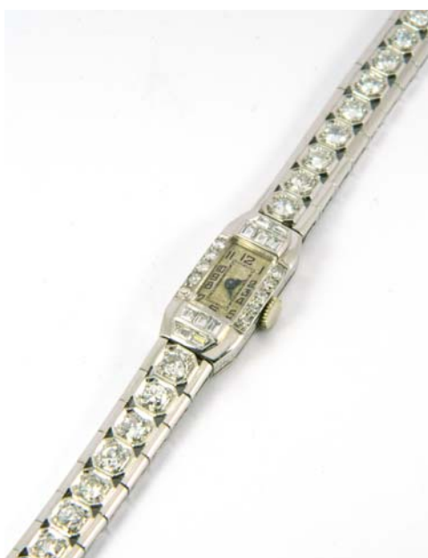
Lot 240 €3,000-€4,000