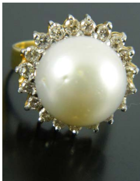
Lot 461 €300-€500