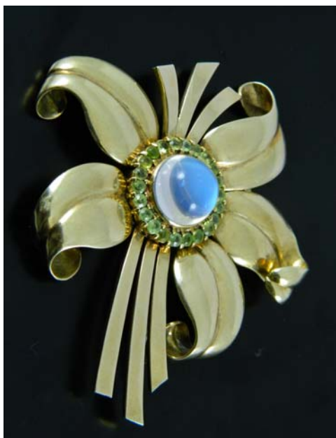
Lot 160 €900-€1,000