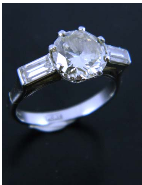
Lot 220 €4,000-€6,000