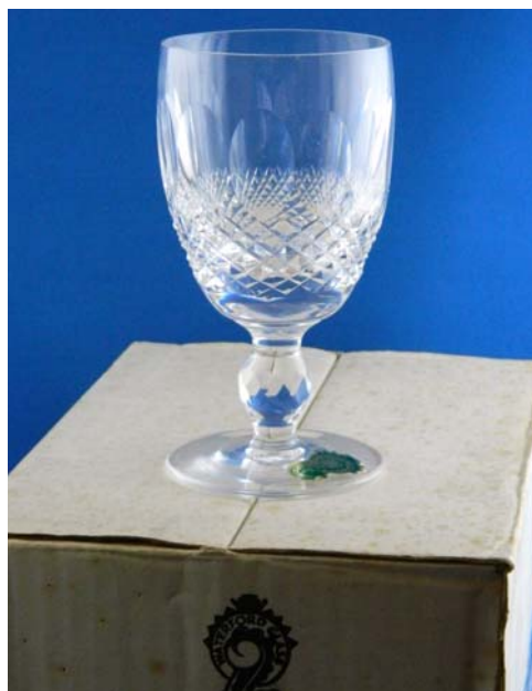
Lot 319 €60-€80