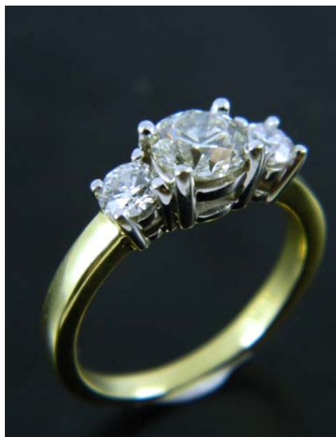
Lot 218 €2,000-€3,000