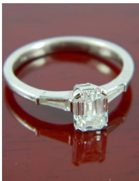
Lot 102 €500-€700