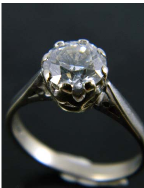
Lot 203 €4,000-€6,000