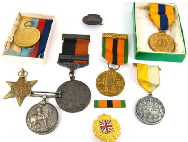
Lot 332 €300-€500