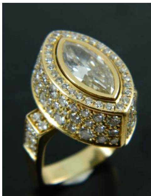
Lot 154 €7,000-€8,000