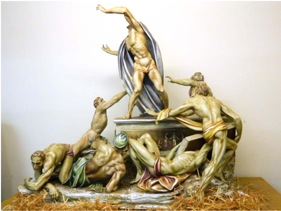
Lot 368 €400-€600