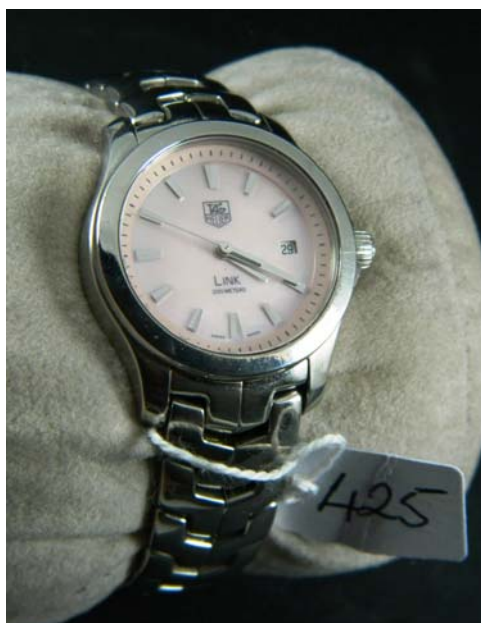
Lot 425 €500-€600