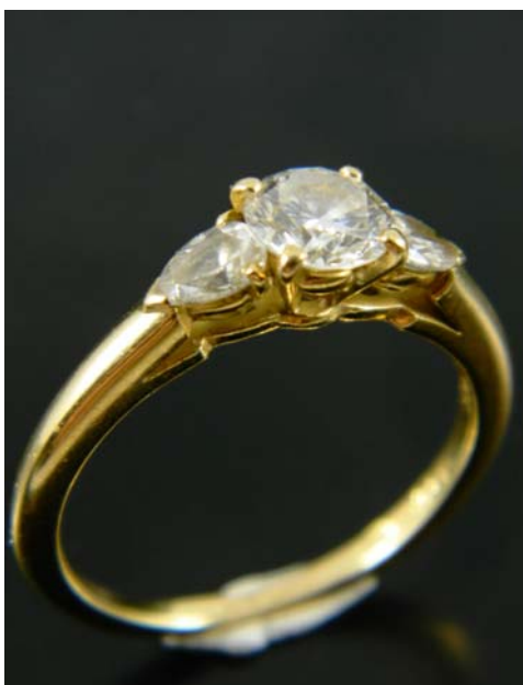
Lot 209 €2,000-€3,000