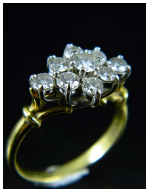
Lot 116 €300-€500