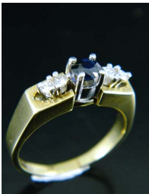
Lot 132 €150-€250