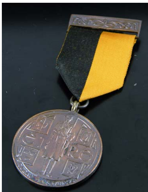
Lot 340 €150-€250