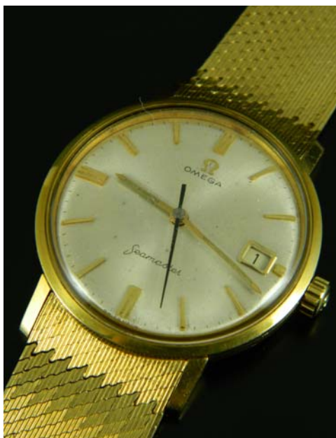
Lot 271 €1,500-€2,000