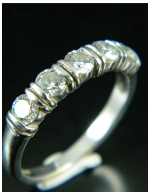
Lot 217 €500-€700