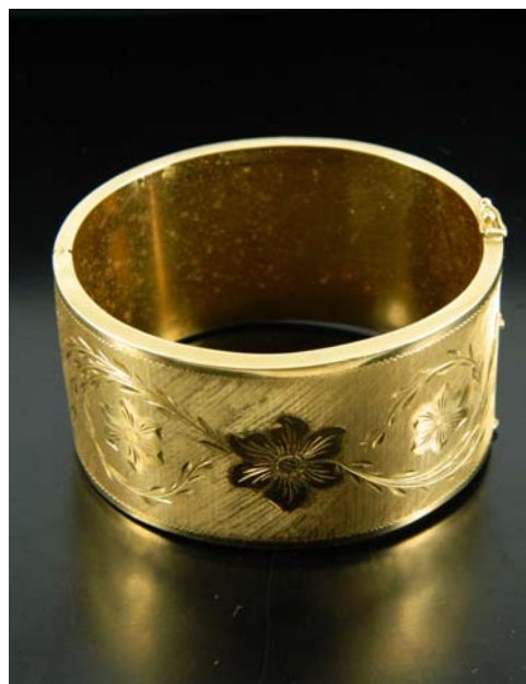
Lot 124 €800-€1,200