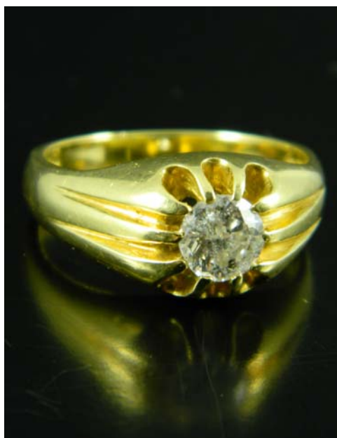
Lot 131 €500-€700