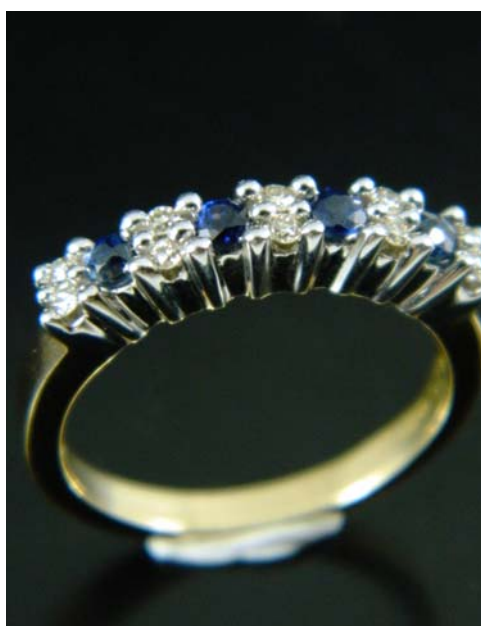
Lot 149 €150-€250