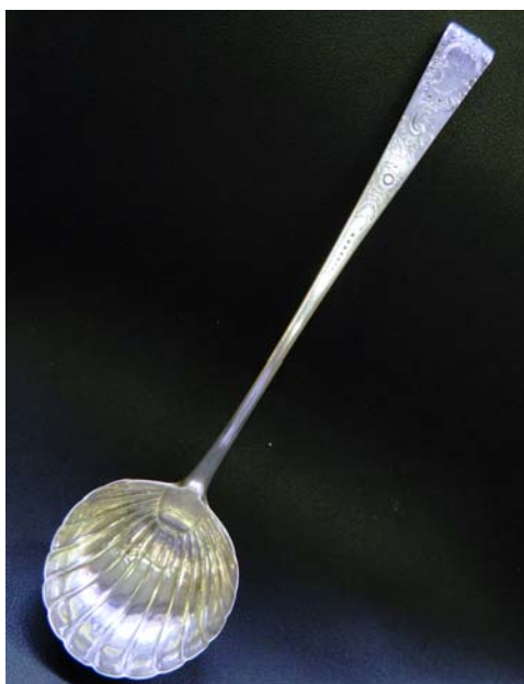
Lot 316 €300-€500