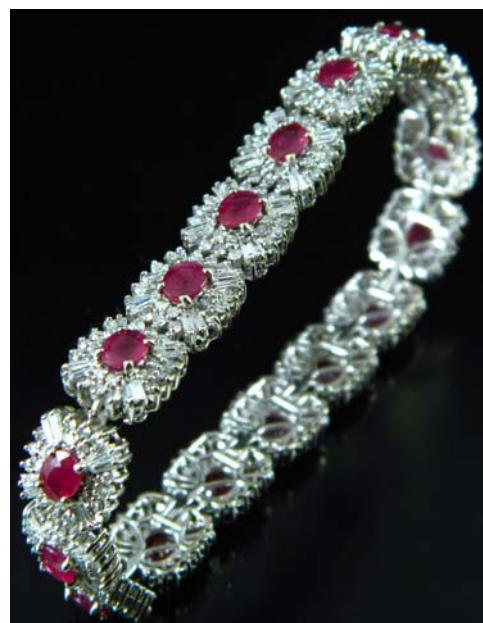
Lot 102 €4,000-€5,000