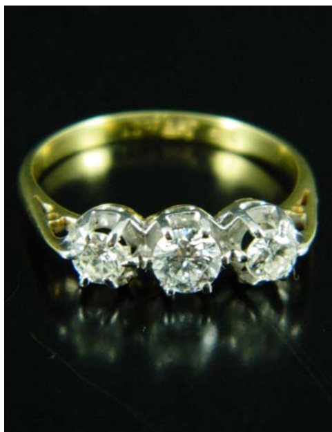
Lot 120 €150-€250