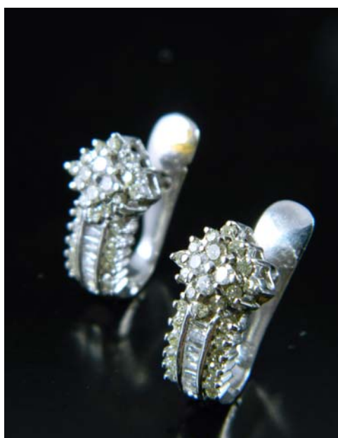
Lot 103 €600-€800