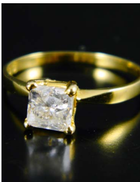
Lot 113 €1,000-€1,500