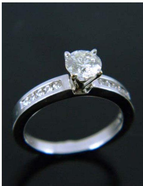
Lot 16 €600-€800