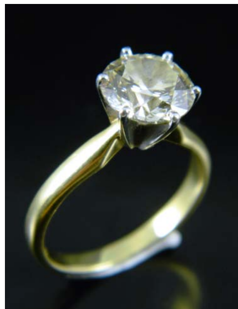
Lot 240 €3,500-€4,500