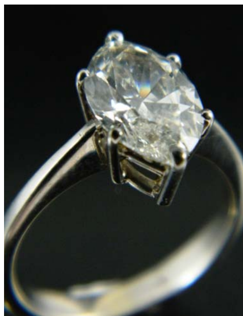
Lot 212 €10,000-€12,000