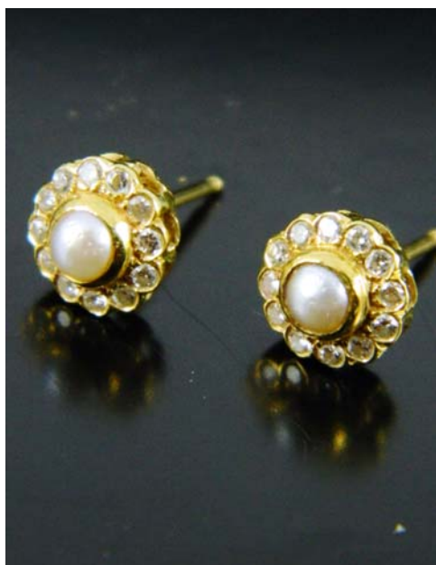
Lot 202 €200-€300