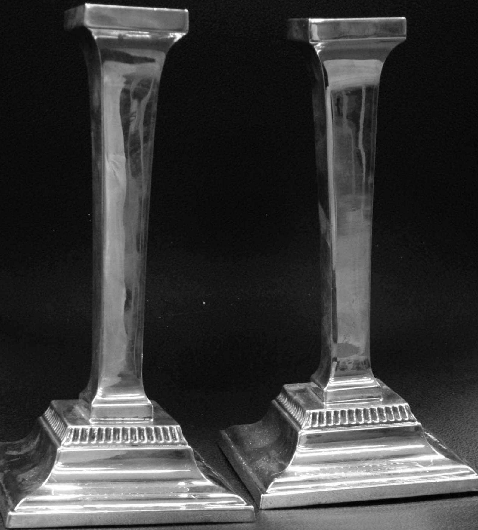
Lot 335 A pair of Irish silver candlesticks Dublin 1973 €600-€900