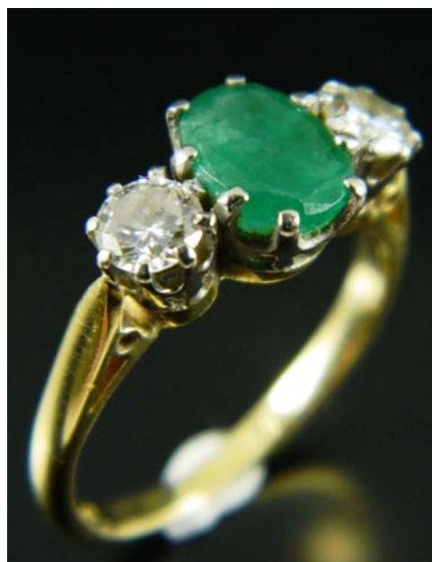
Lot 145 €250-€350