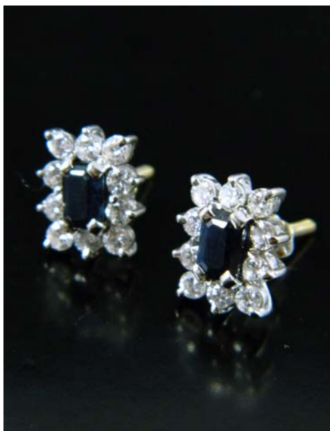
Lot 239 €500-€700