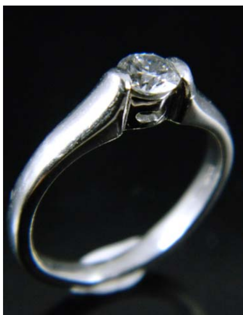
Lot 246 €350-€450