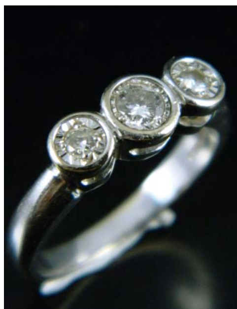
Lot 186 €150-€250