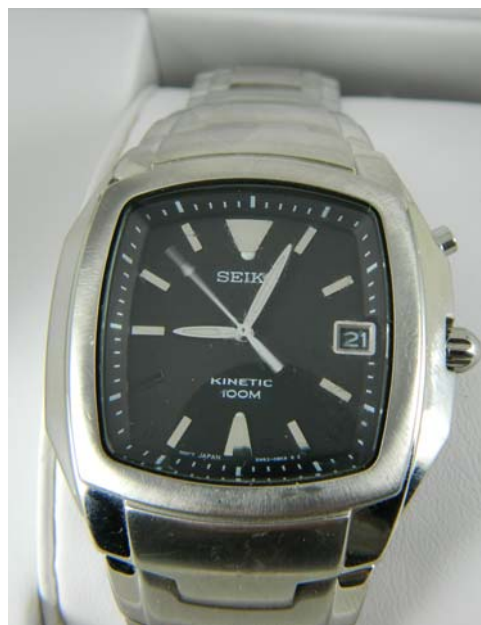
Lot 272 €40-€80