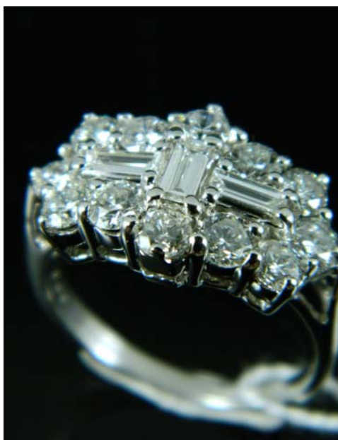
Lot 428 €1,500-€1,700