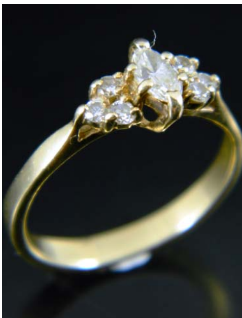
Lot 190 €80-€120