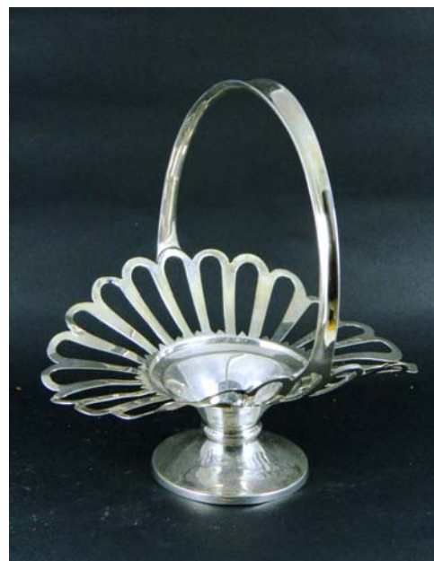
Lot 314 €40-€60