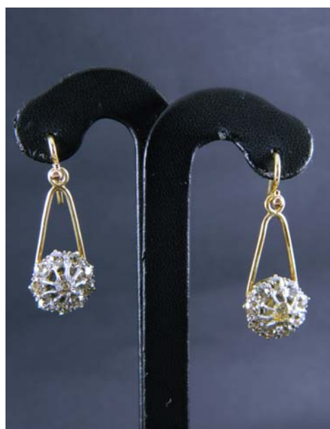
Lot 233 €1,200-€1,400