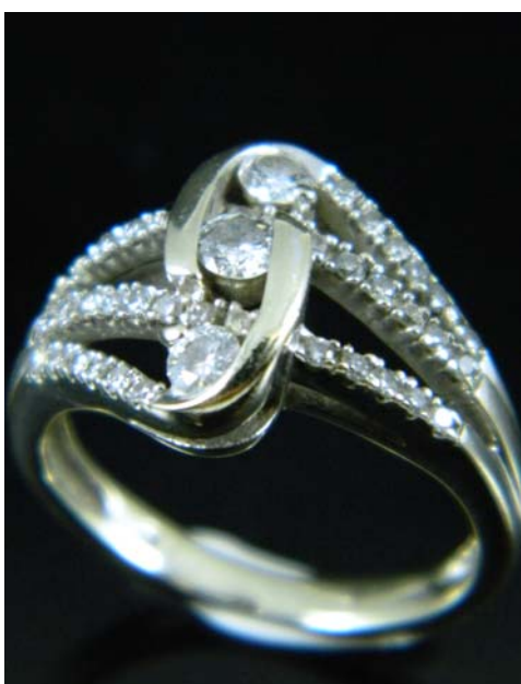
Lot 228 €200-€300