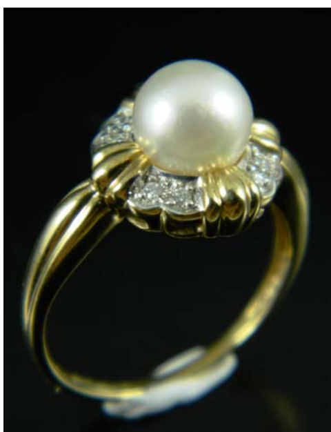
Lot 156 €150-€250