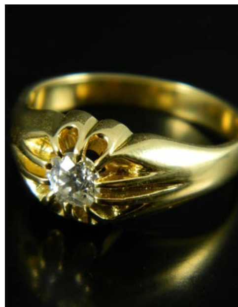
Lot 244 €600-€700