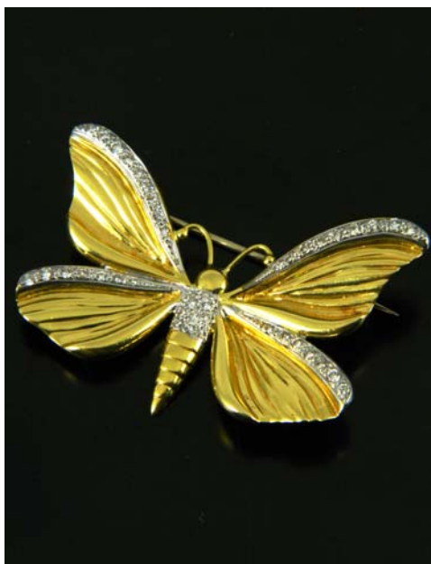
Lot 83 €300-€500