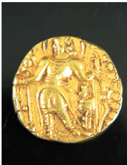
Lot 389 €130-€180