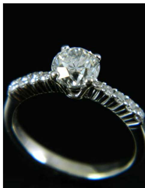
Lot 27 €2,500-€3,000