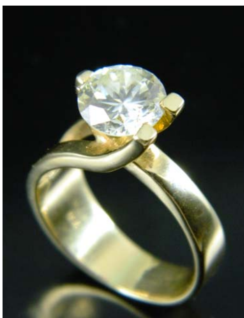
Lot 249 €4,000-€5,000