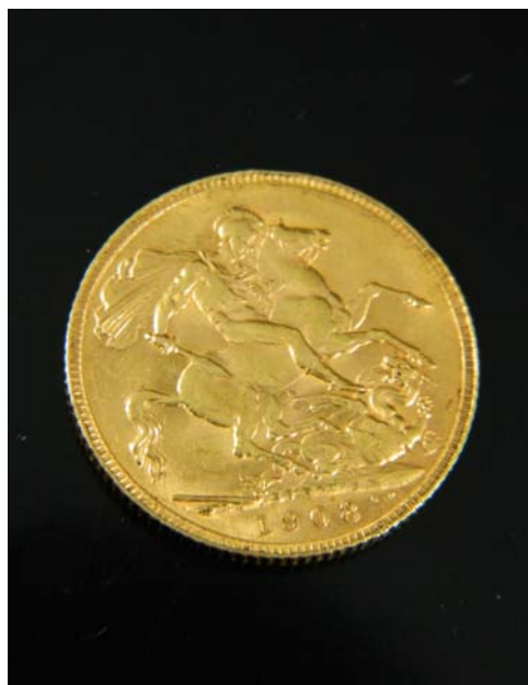
Lot 324 €200-€300