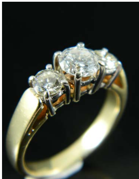
Lot 159 €600-€900