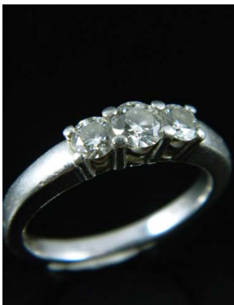
Lot 122 €500-€700