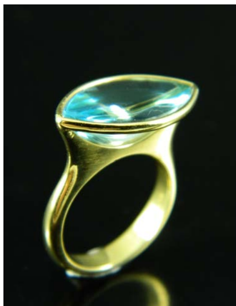
Lot 189 €200-€300