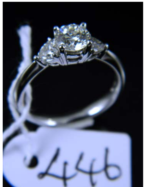
Lot 446 €650-€750