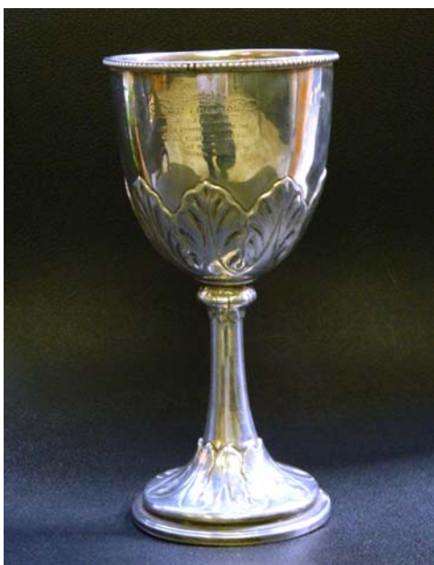
Lot 258 €120-€180