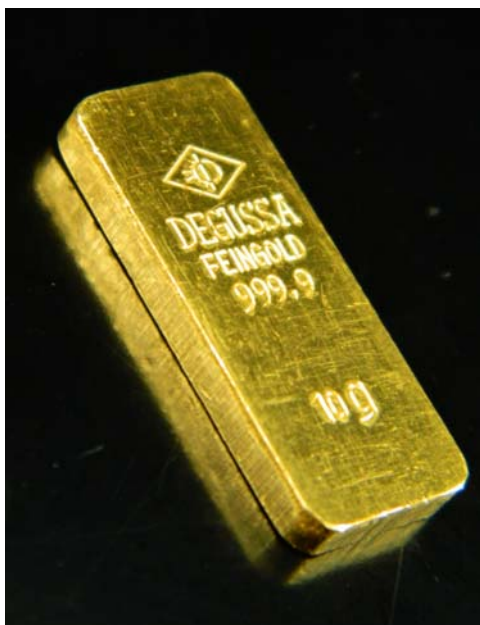
Lot 319 €200-€300