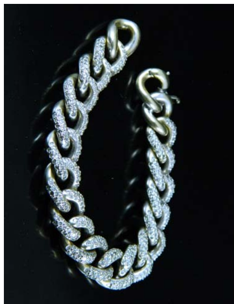
Lot 128 €1,500-€2,500