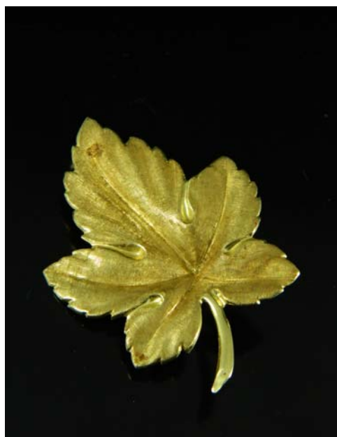
Lot 72 €60-€80