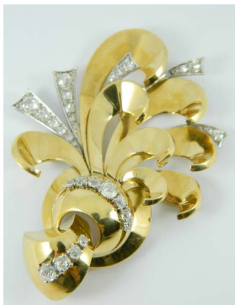
Lot 17 €1,200-€1,800