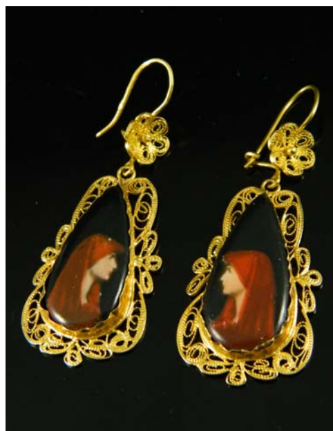
Lot 92 €150-€250