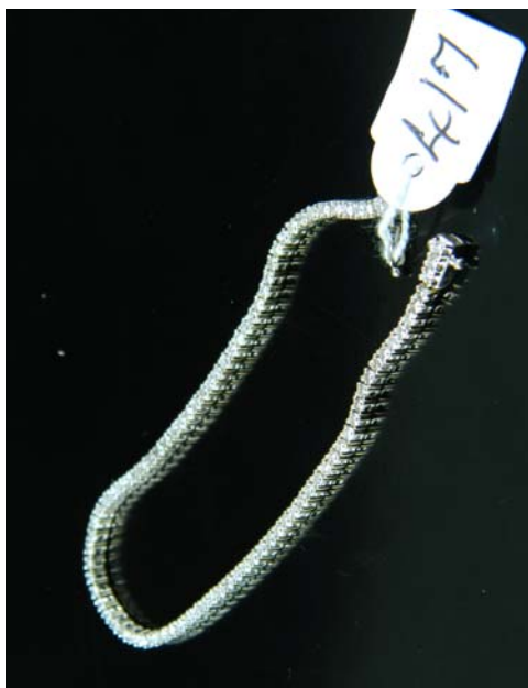
Lot 417 €500-€600