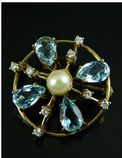
Lot 79 €200-€300