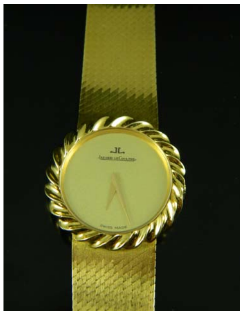
Lot 222 €800-€1,200