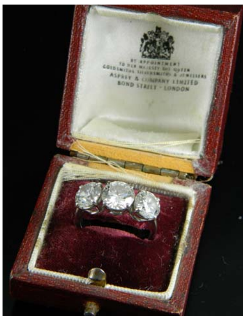
Lot 117 €12,000-€15,000