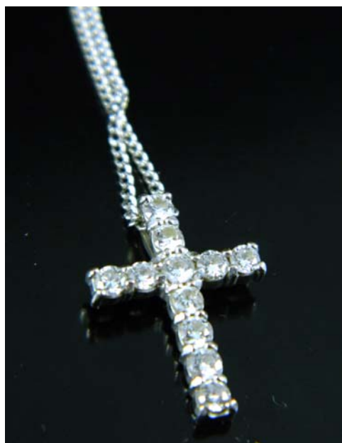
Lot 88 €200-€300