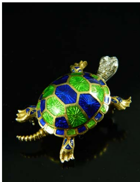
Lot 137 €400-€600