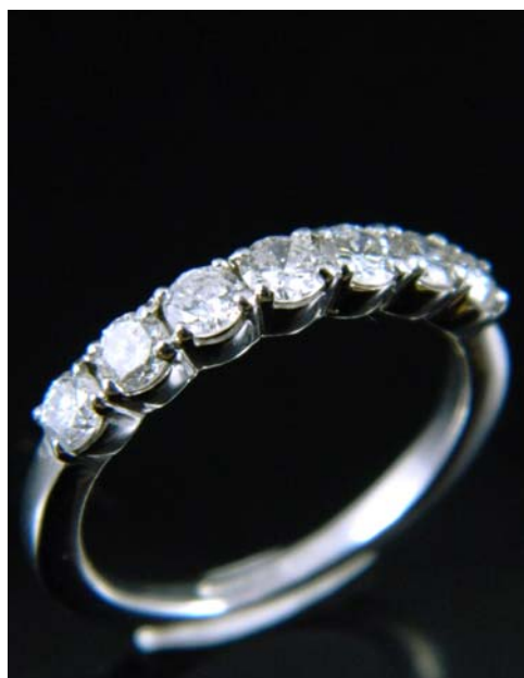
Lot 125 €500-€700