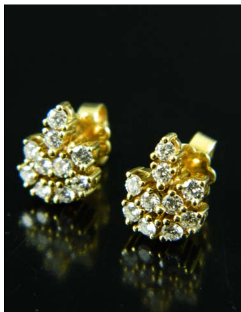
Lot 147 €600-€700