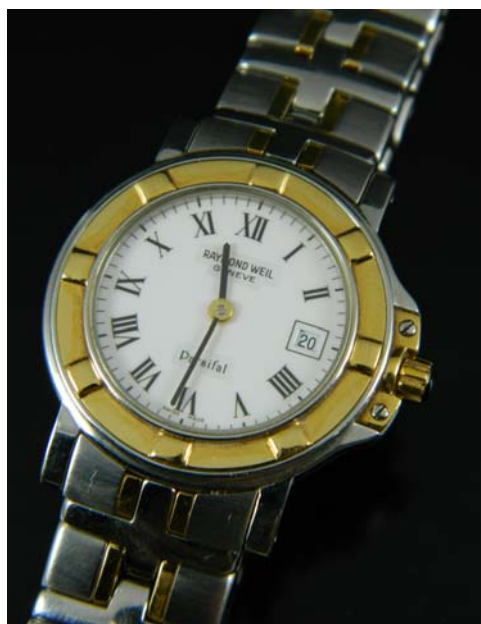
Lot 226 €200-€300