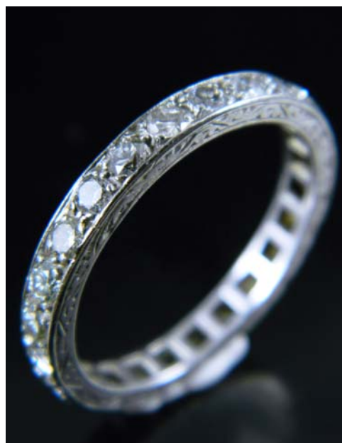
Lot 123 €500-€700