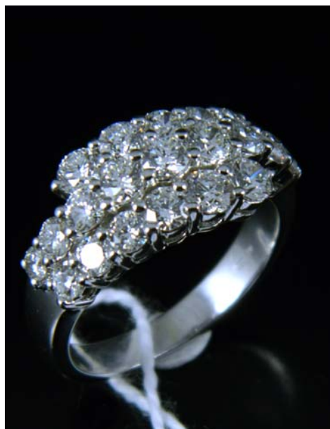
Lot 424 €1,200-€1,500