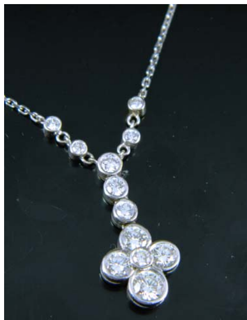
Lot 119 €1,000-€1,500