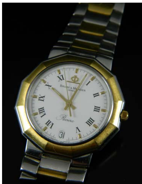
Lot 217 €150-€250