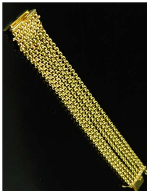
Lot 70 €500-€700