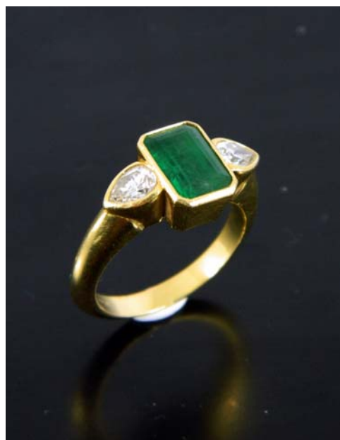
Lot 25 €1,500-€2,000