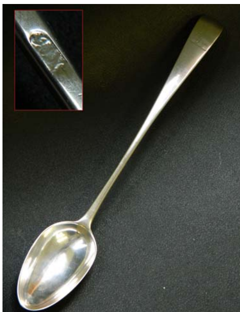
Lot 236 €400-€600