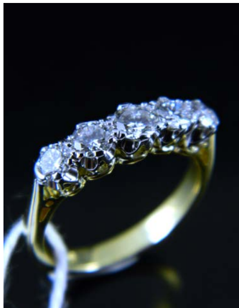
Lot 428 €500-€700