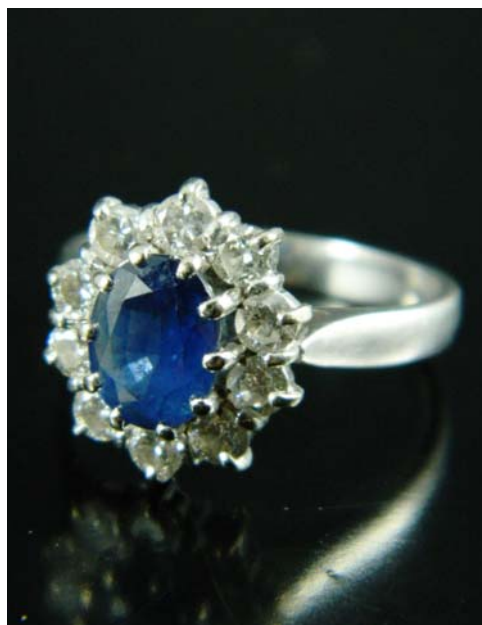
Lot 69 €650-€850