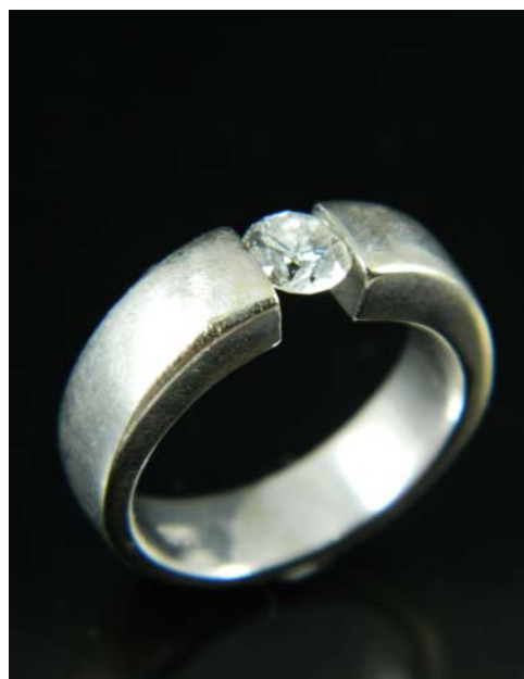
Lot 87 €700-€900