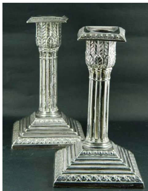
Lot 245 €200-€400