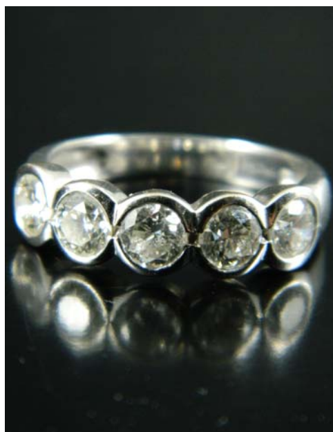
Lot 121 €1,000-€1,500