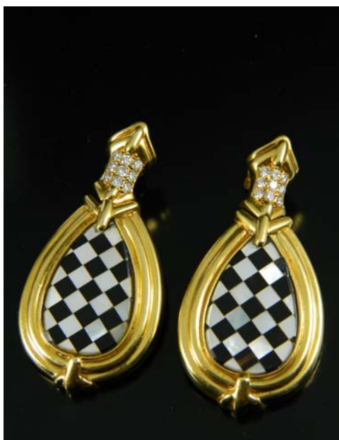
Lot 91 €400-€600