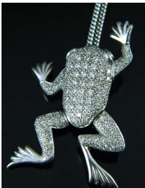
Lot 126 €1,500-€2,500