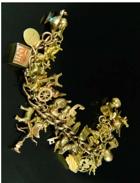
Lot 130 €700-€900